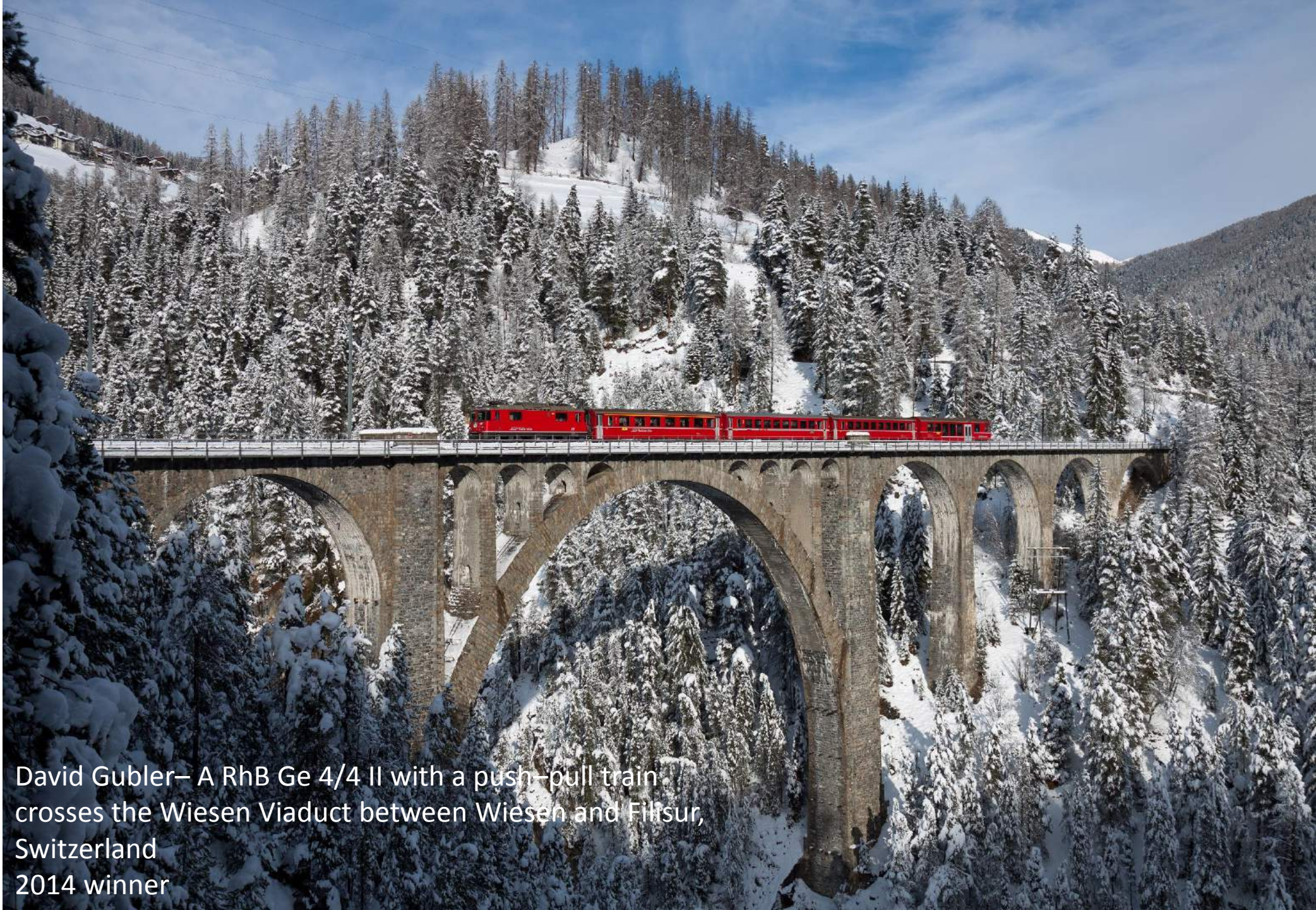
David Gubler– A RhB Ge 4/4 II with a push-pull train crosses the Wiesen Viaduct between Wiesen and Filisur, Switzerland 2014 winner